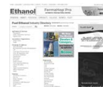
Bonus: Medium Rectangle Online Ad

BONUS: Receive 1 year FREE medium rectangle ad on Directory.EthanolProducer.com with the purchase of a display ad.