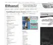
Bonus: Medium Rectangle Online Ad

BONUS: Receive 1 year FREE medium rectangle ad on Directory.EthanolProducer.com with the purchase of a display ad.